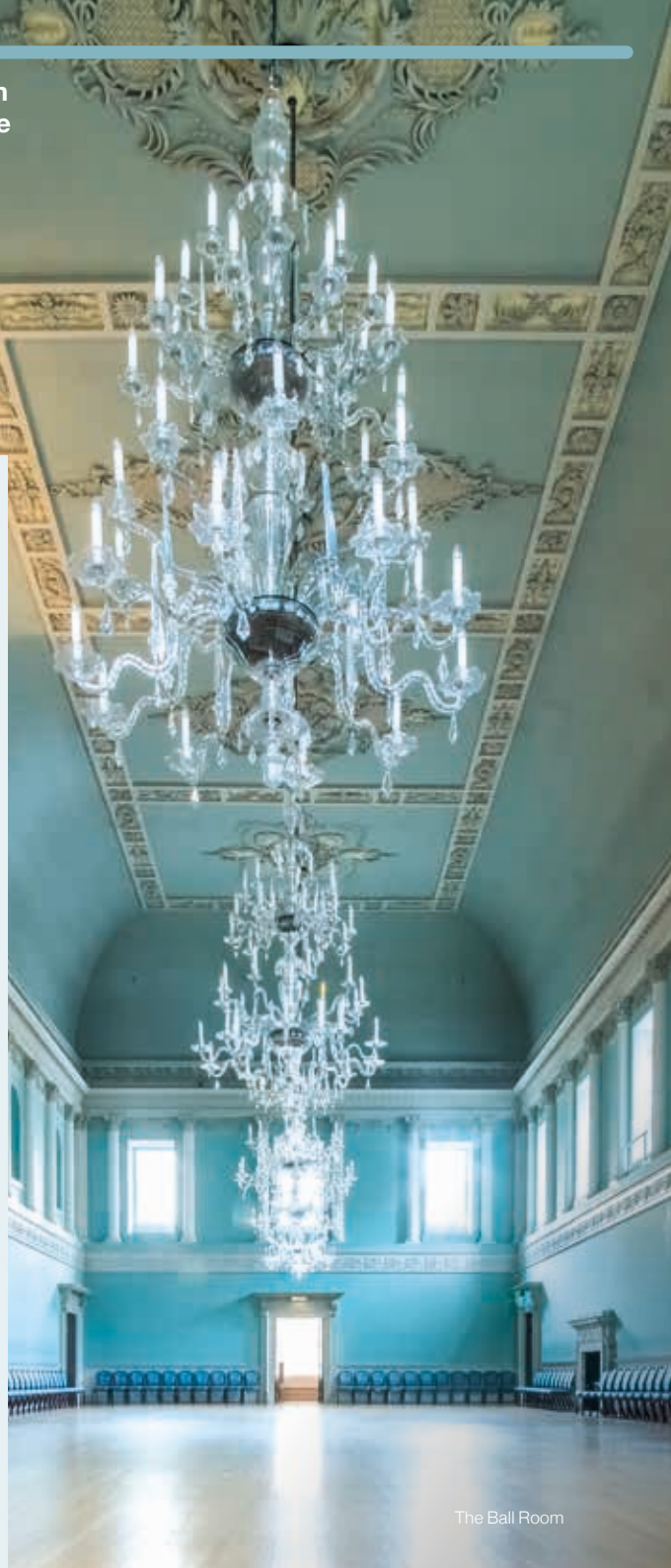
The Ball Room

f BathsHistoricVenues @bathvenues p bathshistoricvenues