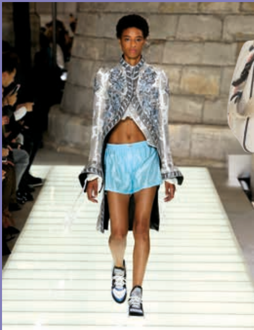
Far left: Silk embroidered redingote style coat worn with light blue jersey shorts and 'Archlight' sneakers by Nicolas Ghesquière for Louis Vuitton, S/S 2018.

For 2018 the fashion journalist Alexander Fury selected looks by Nicolas Ghesquière for Louis Vuitton and Kim Jones for Dior as Dress of the Year (pictured below).