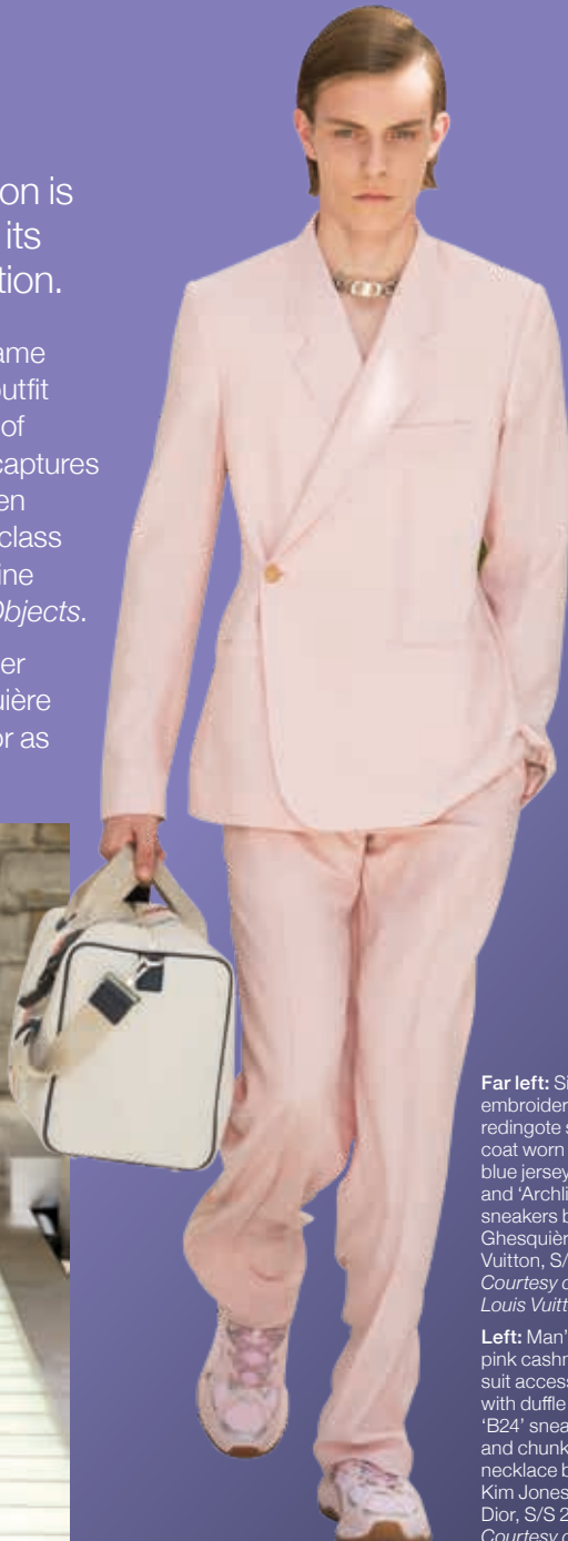
Left: Man's light pink cashmere twill suit accessorised with duffel bag, 'B24' sneakers and chunky metal necklace by Kim Jones for Dior, S/S 2019.