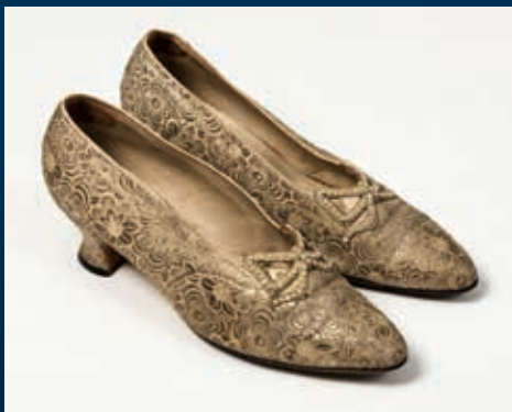
Far left: Gold brocade shoes with diamanté bows by Rayne 1935, worn by Queen Mary